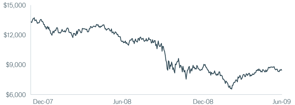
Daily closing levels for the Dow Jones Industrial Average from 12/3/07 - 6/30/09

During the recession beginning in 2007, the extreme dips in the market made it hard for investors to see beyond the volatility. In such difficult times, it's not easy to look past the current state of the market and focus on the long term.