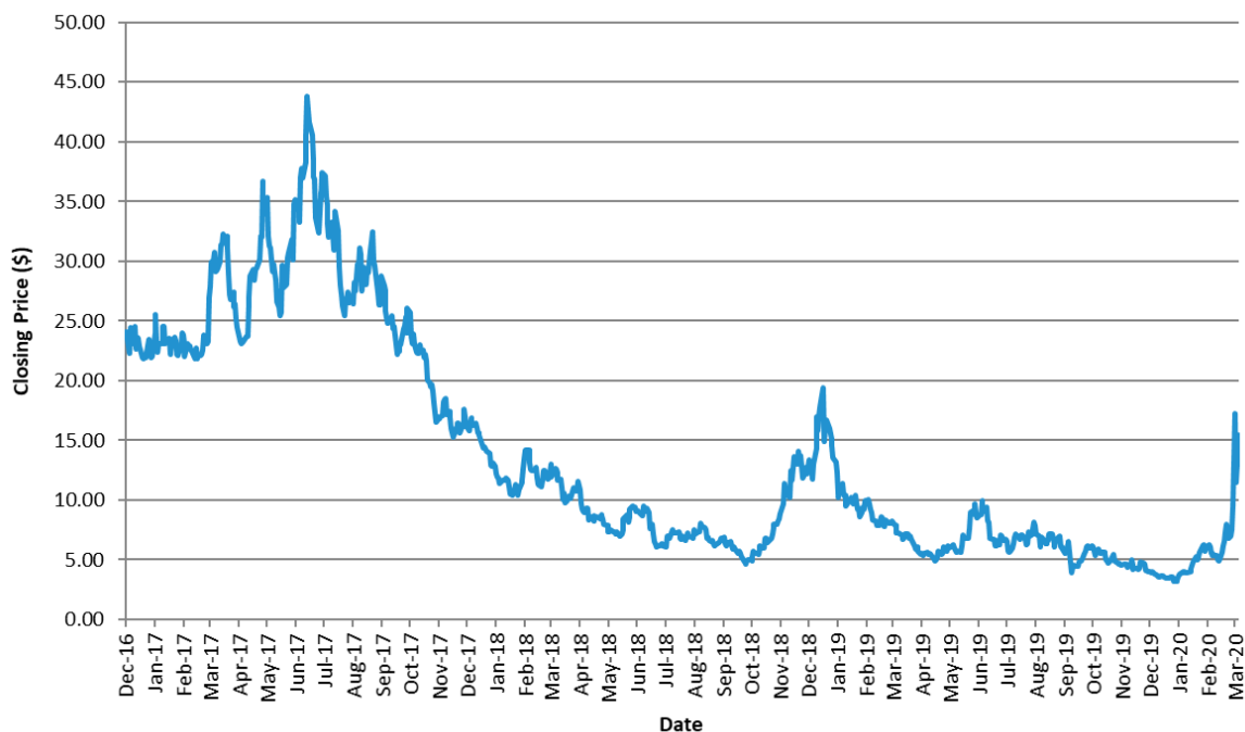
Historical Daily Closing Prices for the 3x Inverse Crude Oil ETNs December 8, 2016 to March 12, 2020